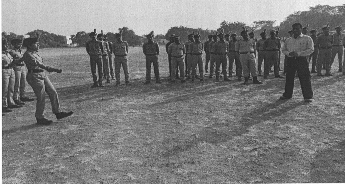
Pre Rank Training Capsule :21 December 2019